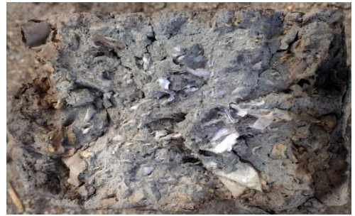
Fig 4: Interior of papercrete after burning

From the observation it is noted that outer surface of the papercrete is burnt and the interior is not burnt .when the bricks are placed in a fire for a long time it burns like the charcoal and paper present in papercrete is completely burnt. Therefore interior and exterior plasters need to provide for prevention from fire accidents.