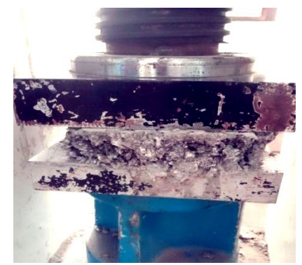
Fig 1: Papercrete brick after a compressive strength test

From the graph, we can conclude that compressive strength of water cured brick is higher than the sun-dried brick. The 25% to 50% of GGBS replaced by cement shows the higher value of compressive strength