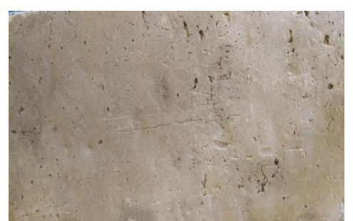
Fig 5: Hardness test for Papercrete having 25% of GGBS

Hardness test is used to find that the papercrete brick is hard or not. The test is done by scratching the brick with sharp object or nail. The figure shows the hardness test result.