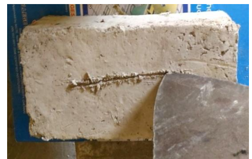
Fig 6: Hardness test for papercrete having 75% of GGBS

From the result, we can conclude that the papercrete with 0% to 25% is sufficiently hard. Papercrete having GGBS percentage above 50 is not hard.