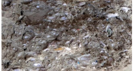
Fig 2: Interior structure of papercrete brick

In this test papercrete brick is broken and its interior structure is examined. This test is done to find out the presence of any defects such as lumps, holes...the present I the papercrete brick.