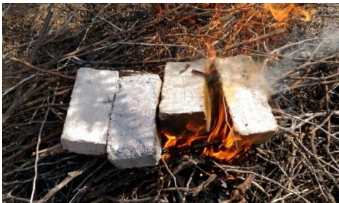
Fig 3: Burning of papercrete brick